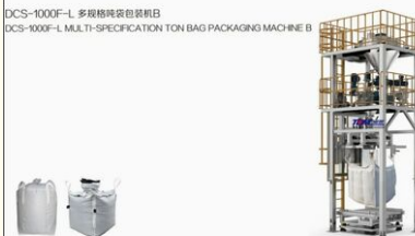
DCS-1000F-L 多规格吨袋包装机B DCS-1000F-L MULTI-SPECIFICATION TON BAG PACKAGING MACHINE B