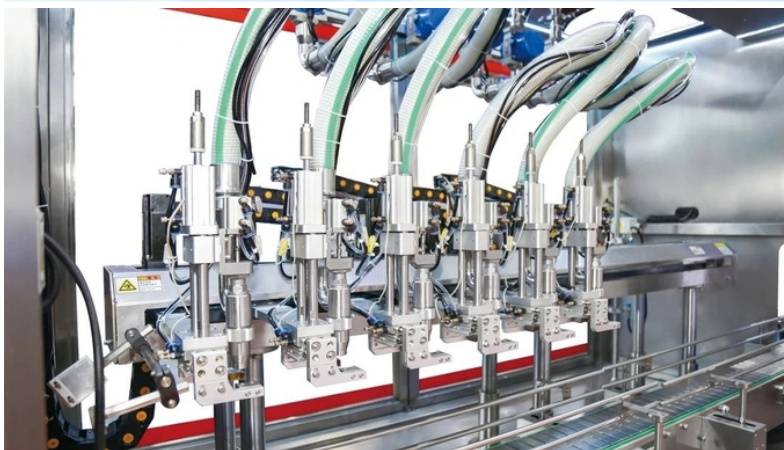
Packaging & shipping: