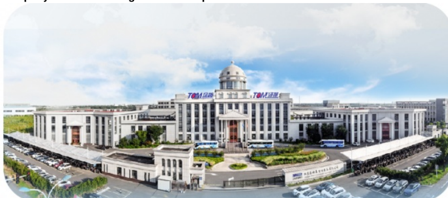
Tom "The Little White House"