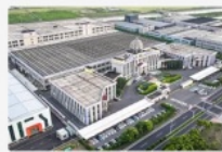
Panorama of the company