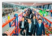
Case display area