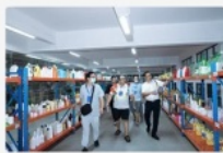
Case display area