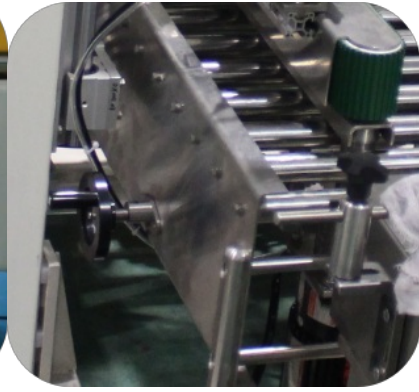
6, The carton opening machine has a reasonable structure and stable and reliable performance