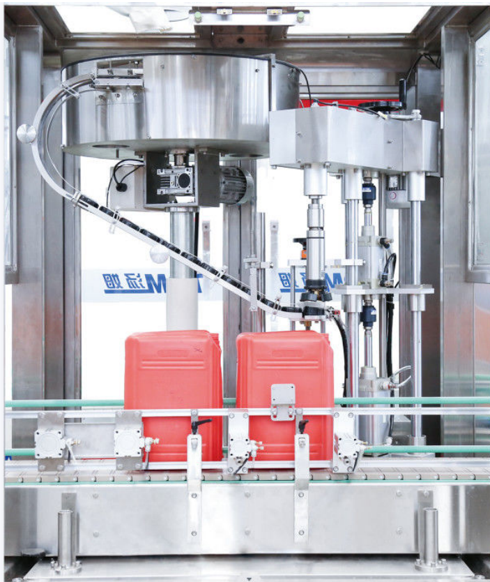
Automatic cap feeding and cap screwing; Button start;