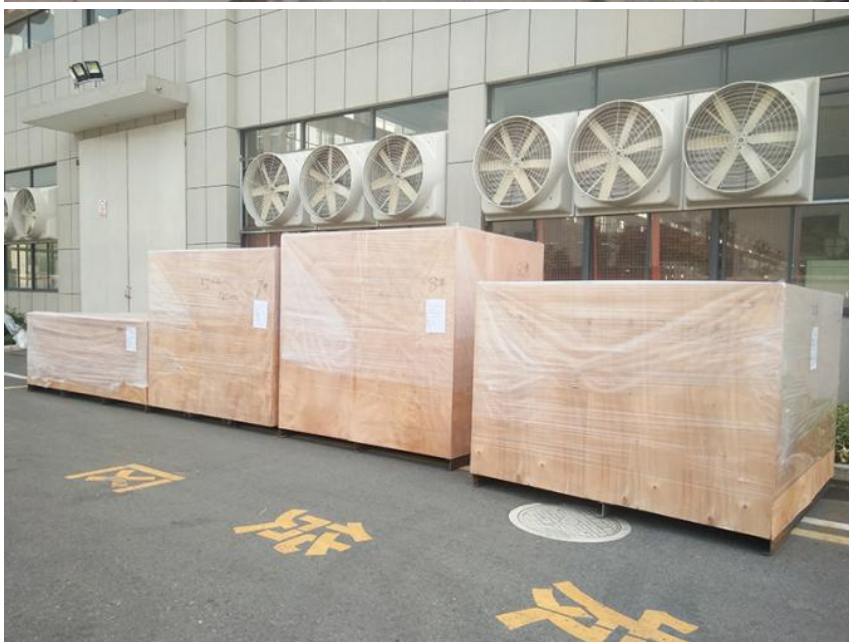
The goods are all loaded at TOM factory by TOM's logistic department.