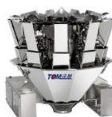
组合秤下料装置 Composite scale filling device