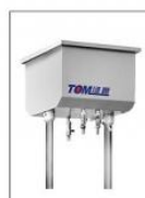
液体自流下料装置 Liquid gravity filling device