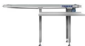
平步带输送机 Belt conveyor