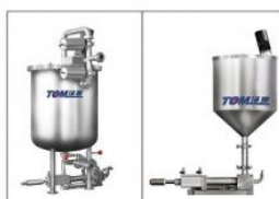
液体气动 / 伺服活塞下料装置 Liquid pneumatic/servo piston feeding device