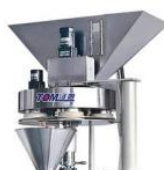
量杯颗粒下料装置 Cup granular filling device