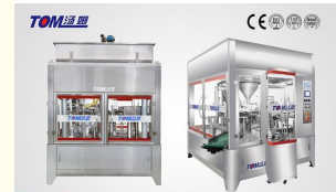
Choose TOM, one-step to reach (powder, granule, liquid filling equipment) FJ-210GD FJ-300GD FJ-350GD Intelligent rotary bag packing machine