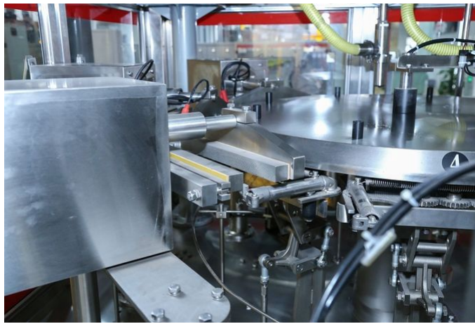
This is the bag feeding part, the people need to put the new empty bags into feeding part manually, usually it can house 200-300pcs of bags