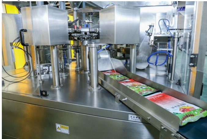
Here's the different material feeding device, dust collector and other auxiliary machines, can meet different requirements of customers