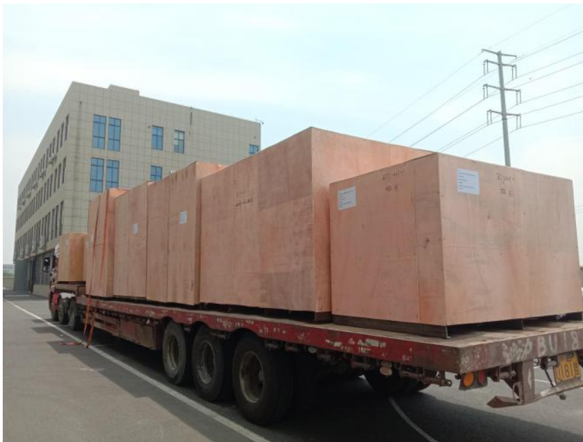
Tom factory picture