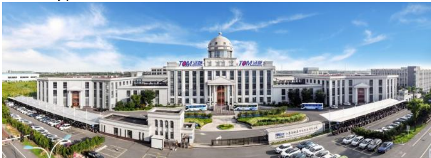
Customer visiting in Tom factory