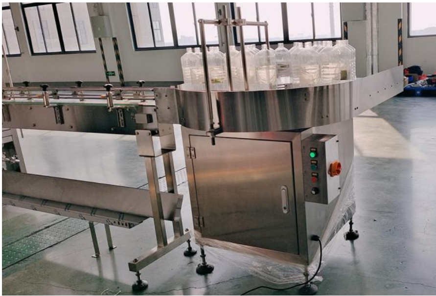
This feeding table can be customized for food industry which added dust production cover.