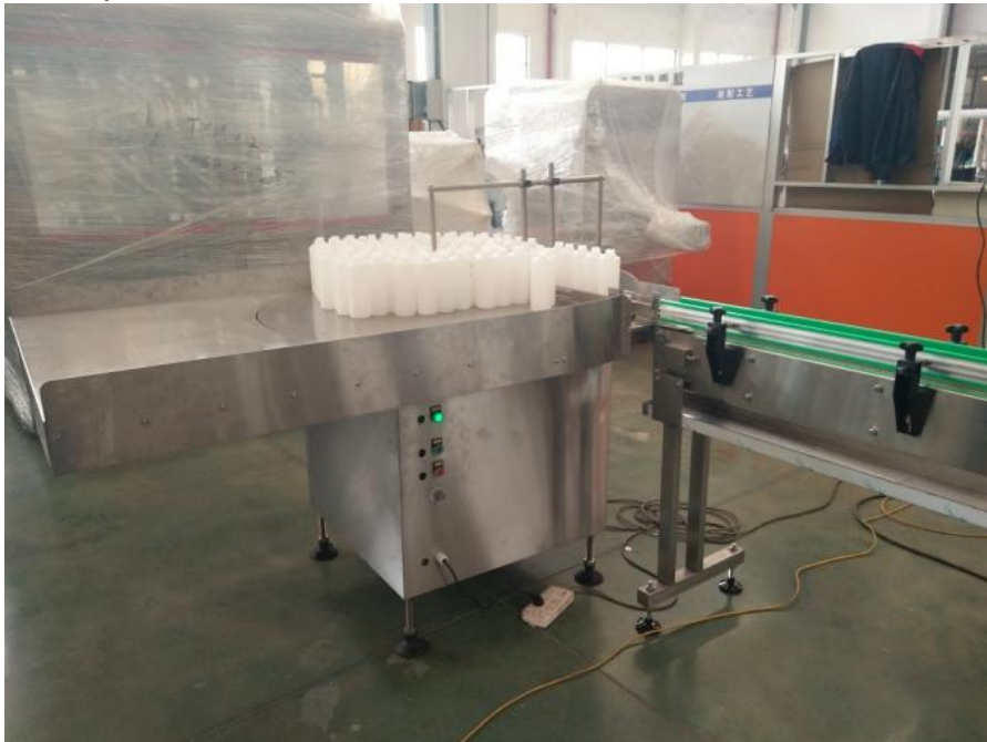
Machine picture in front