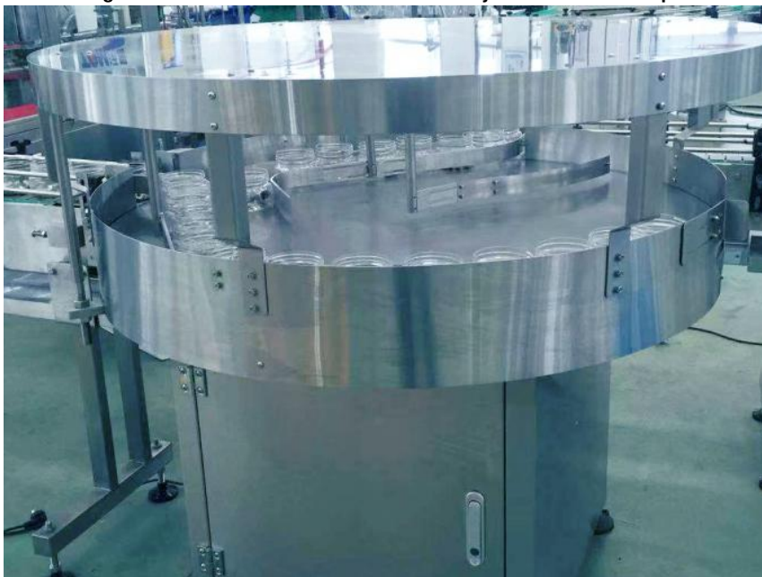
The dust cover can prevent the dust enter into bottle during running