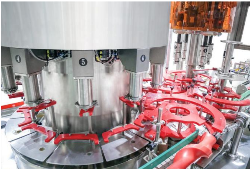
The cap sorter can incessantly feed caps to capping machine, match to capping machine