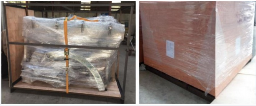
Ware house for finished packed machines: