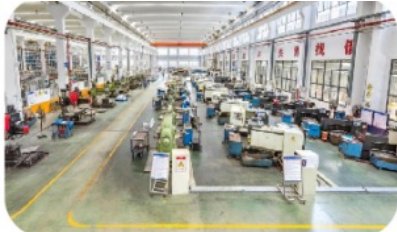
New factory processing center