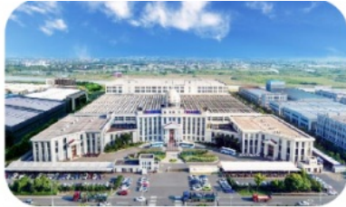
Company real scene