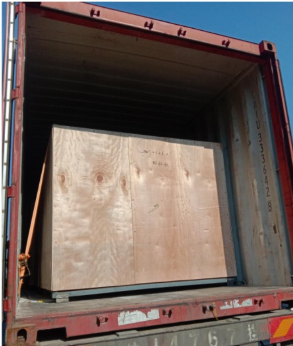
Company Overview--Jiangsu Tom Group