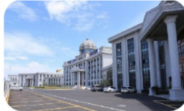
Company covers an area of 150 m 2 office building