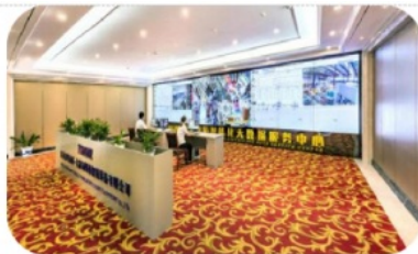
After-sales service big data service center

TOM 汤姆 Jiangsu TOM Intelligent Equipment Co., Ltd.,