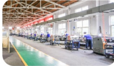
Old factory processing center