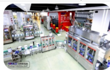
Large packaging machine showroom