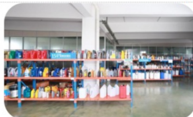
Packaging material display area