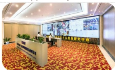
After-sales service big data service center