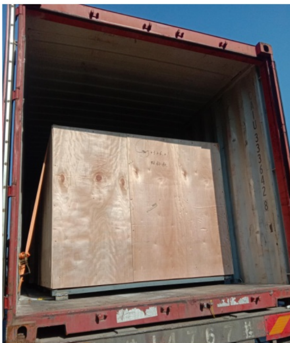
Company Overview--Jiangsu Tom Group