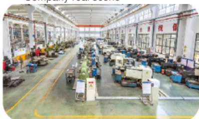
New factory processing center