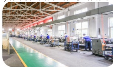
Old factory processing center