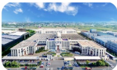
Company real scene