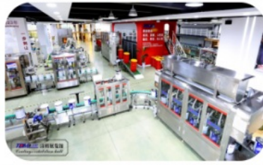
Large packaging machine showroom

TOM 汤姆 Jiangsu TOM Intelligent Equipment Co., Ltd.,