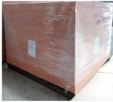
warehouse for finished machine: