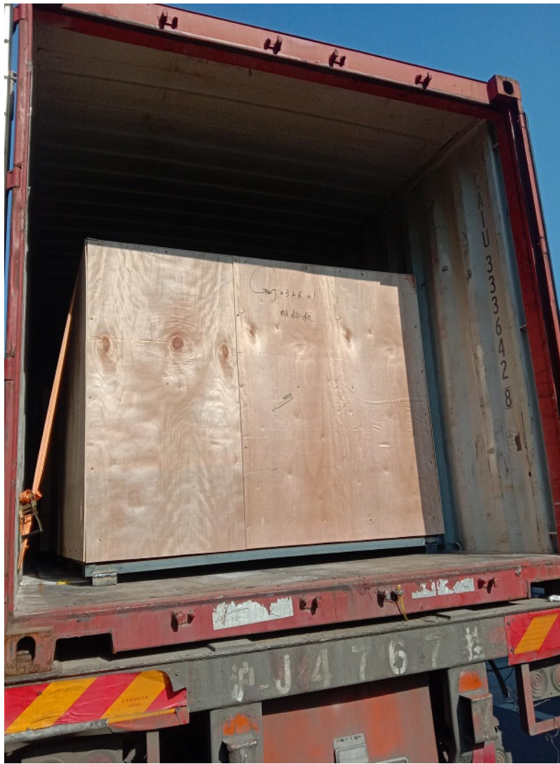
Company Overview--Jiangsu Tom Group