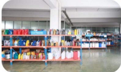
Packaging material display area