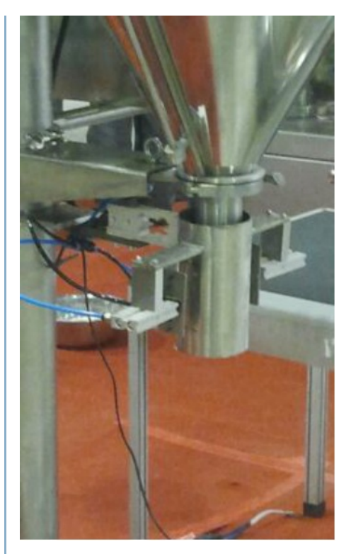
with the Mettler Toledo weighing sensor