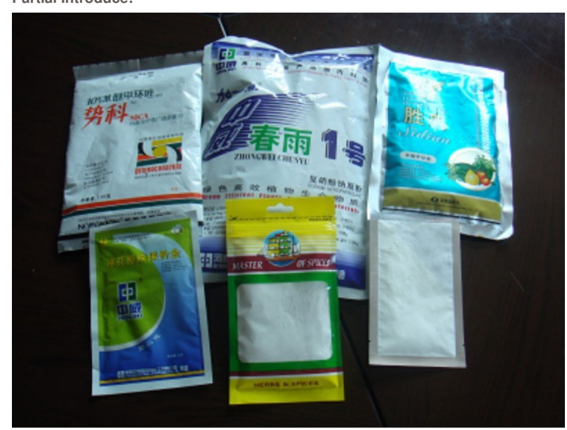
Powder screw feeding machine