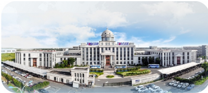
Tom "The Little White House"

Jiangsu Tom Group is an enterprise specializing in the production of pesticide / veterinary medicine, fertilizer and chemical intelligent equipment. The factory covers an area of 150 acres and has a construction area of 120,558 square meters. It has 710 employees, 2 doctoral students, 30 master students, and 358 undergraduates. It has obtained ISO9001 quality system. Certification, ISO14001 Environmental Management System Certification, OHSAS18001 Occupational Health and Safety System Certification, CE Certification, Jiangsu Province Specialized Specialized New "Little Giant" Enterprise, Changzhou Specialized Specialized New Small and Medium Enterprise, 125 National Utility Patents and 26 National Inventions patent. Over the past 24 years, after the hard work of Tom people, Tom Group has continued to innovate and develop, keeping pace with the times, providing generations of advanced intelligent packaging equipment for more than 3,300 pesticide / veterinary medicine, fertilizer and chemical companies, and building Industry 4.0 intelligent factories for customers; Provide automated three-dimensional warehouse; create smart factory production data acquisition and execution system (MES) for customers.