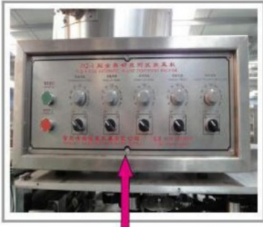
centralized control by SUS304