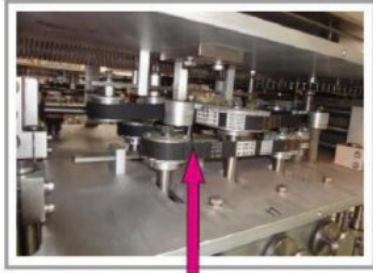
capping transmission part