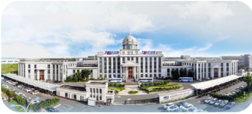
Company real scene: