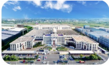
Company covers an area of 150 mu