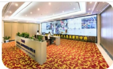
After-sales service big data service center

TOM 汤姆 Jiangsu TOM Intelligent Equipment Co., Ltd.,