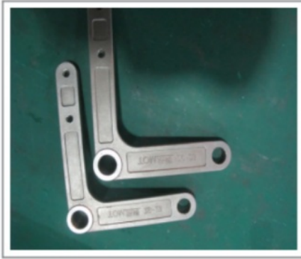
3.Human designed for the button