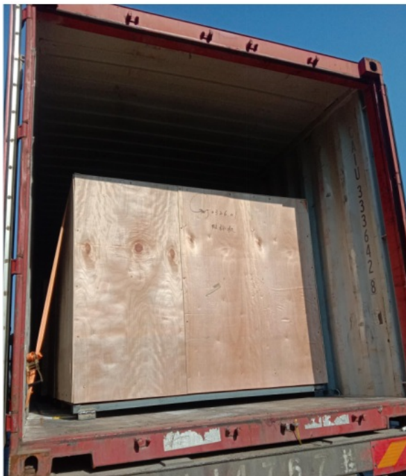
Company Overview--Jiangsu Tom Group

We have a professional logistics team responsible for shipping