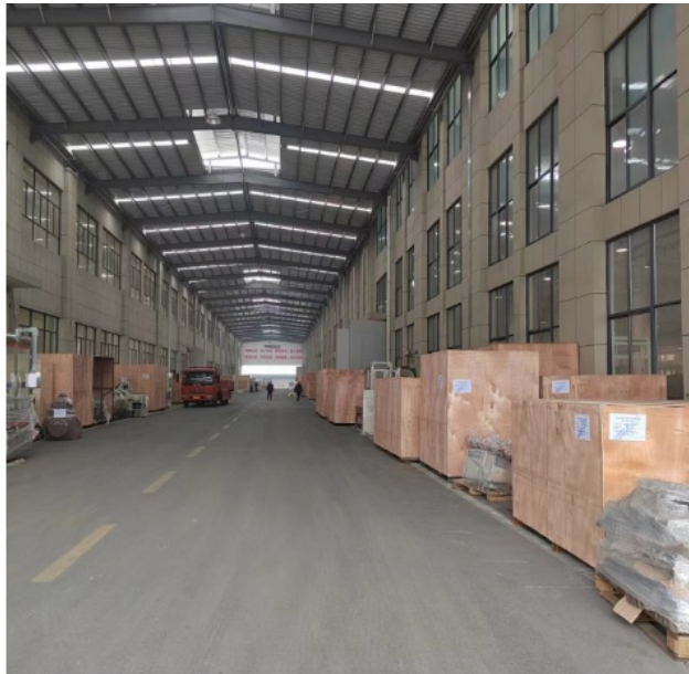
Loading machines into container:

We have a professional logistics team responsible for shipping