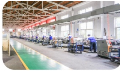
Old factory processing center