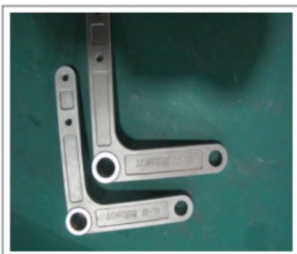
3. Human designed for the button