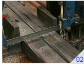
RAW MATERIAL FORGING