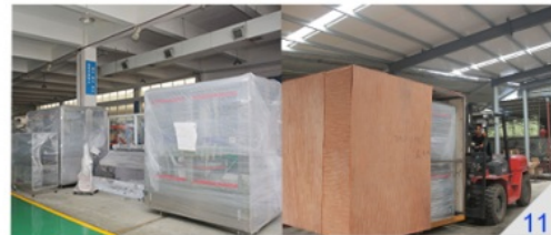
FINISHED PRODUCTS PACKING