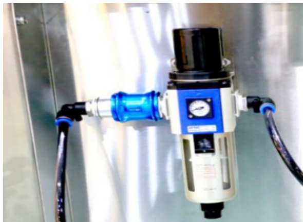
The Photo Of Our Company

An oil-water separator is installed in front of the intake main pipe. When the pressure is too high or too low, the host automatically alarms and stops the machine; (All the above alarms are touch screen display and sound and light alarms at the same time)