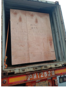
The Photo Of Our Company